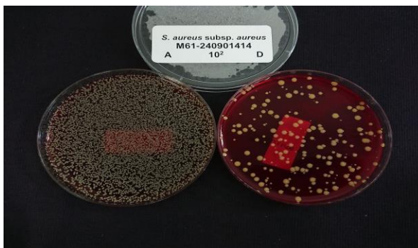
Figure 2: Result of control and test group.

Strains : Staphylococcus aureus subsp. aureus